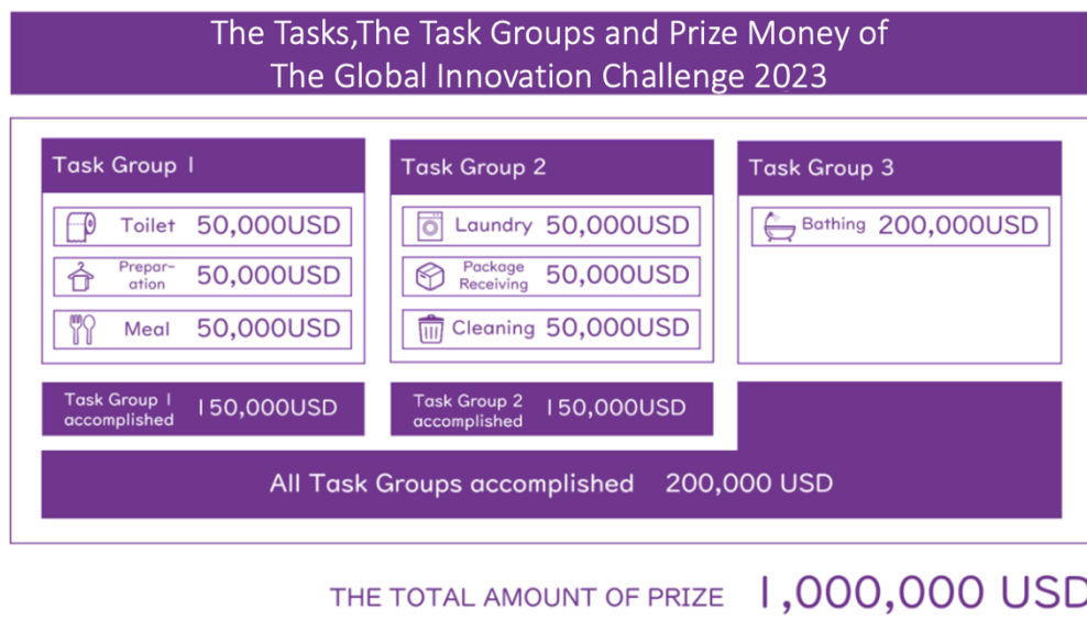
Figure: Tasks, Task Groups and Prize Money of the Global Innovation Challenge 2023