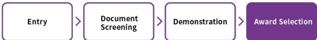
Figure: Contest Stages

The organiser awards teams that complete the Tasks and grants cash prizes.